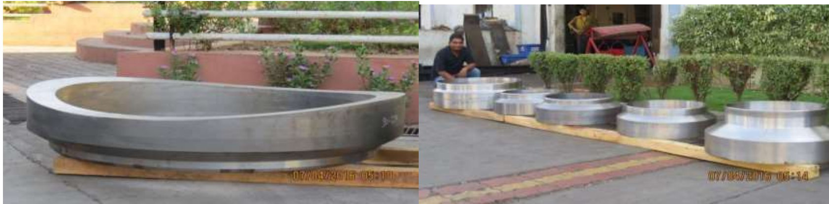
Machined Reinforced nozzles